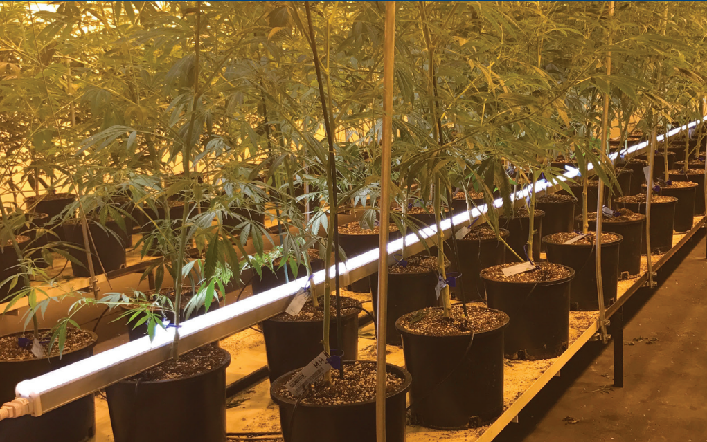
Boost LED Light Bar

Boost yields by lighting from the bottom!